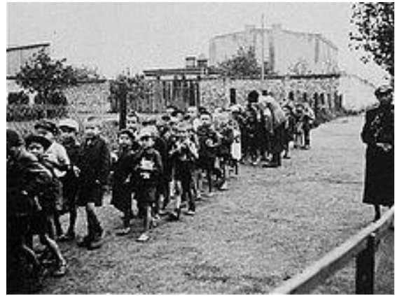
Jewish children during deportation to the Chelmo extermination camp

It seems to me that many people ask, “Why can't we just 'forgive and forget' ? Why do we have to look at all these terrible old photos? Why construct a whole museum with the purpose of preserving evidence of this darkness and evil? Why must we have a memorial day just to dredge up all these painful memories of sadness and loss”?