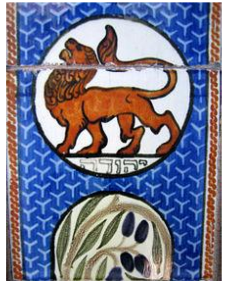
The Lion of Judah on a Bezael ceramic tile.

As the Lion of Judah (Yehudah) Yeshua will pour out His wrath upon the enemies of Israel and provide comfort, consolation, beauty and joy for the survivors of Israel – the remnant who will call upon the name of the Lord in truth and righteousness.