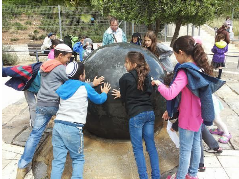
Israeli children trying to move stone on display at Bloomfield Science Museum in Jerusalem

For a while, it will look like it is all over for this tiny country. – until God supernaturally intervenes with the coming of the Messiah who will fight for us against all our enemies.