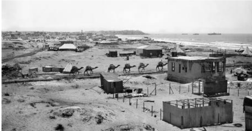
Tel Aviv in 1909