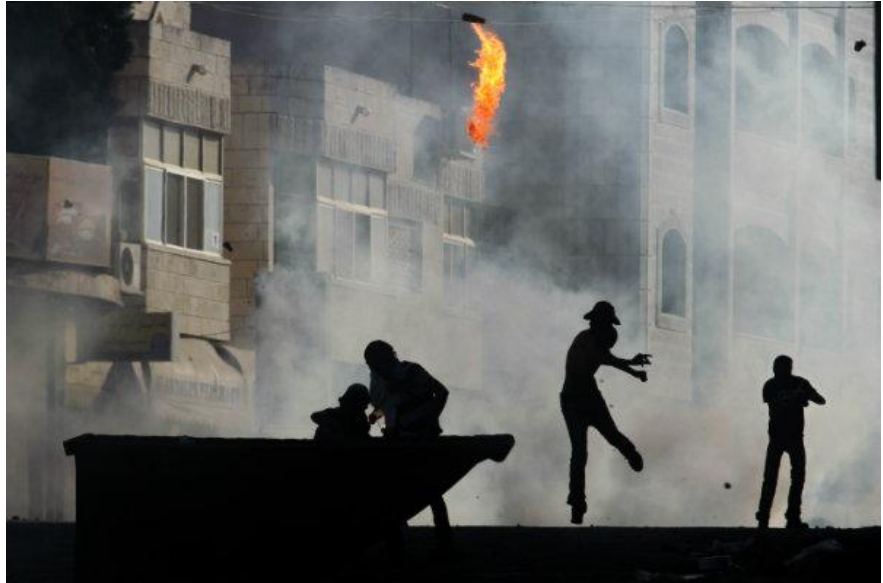
Arabs throwing firebombs on Jewish balconies in Jerusalem

In fact, the Word says that not a single survivor will be left of the house of Esau. "Jacob will be a fire and Joseph a flame; Esau will be stubble, and they will set him on fire and destroy him. There will be no survivors from Esau." The LORD has spoken. (Obadiah 1:18)