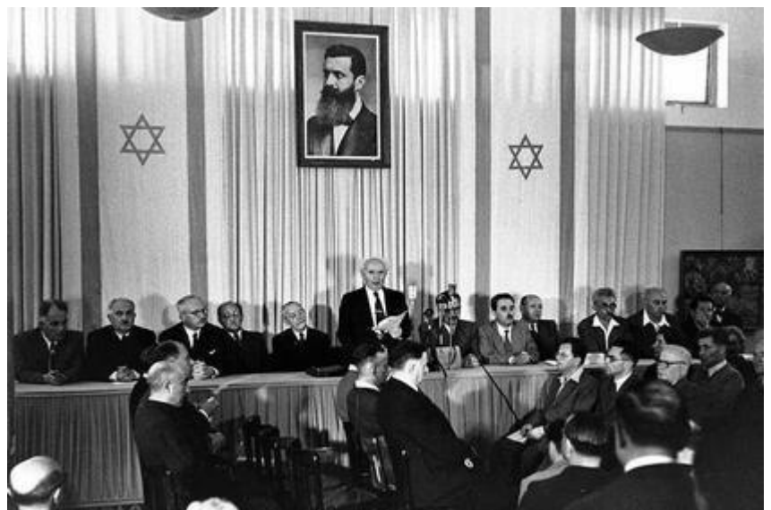
Declaration of the State of Israel