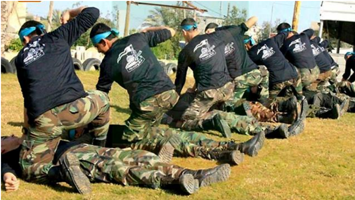
10,000 Palestinian teens training in terror camps – close combat, terror tunnels