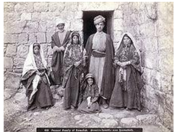
Arab family of Ramallah , Jerusalem District in early 1900s

If we trace the lineage of this covenant we find that it follows through Abram to Isaac (Yitzchak), the child of Promise, not Ishmael, the child of flesh. Even Abraham was temporarily fooled into believing that Ishmael would inherit the Land; but God corrected Him: