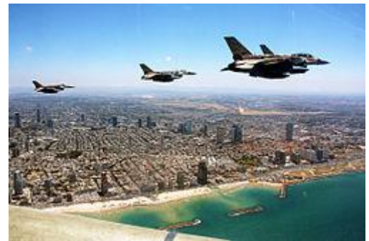
Israeli Air Forces Yom Ha'atzmaut flypast 2011

The Presidents' Residence hosts a reception, special prayers are recited, and the Israel Prize ceremony takes place on this day as well.