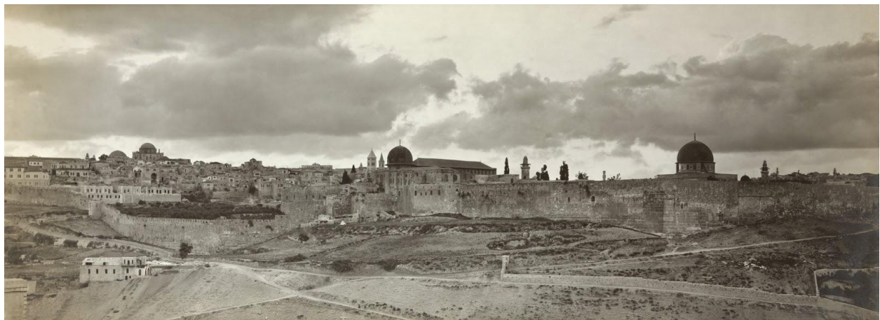
http://upload.wikimedia.org/wikipedia/commons/f/fa/Jerusalem_panorama_early_twentieth_century2.jpg Jerusalem Early Twentieth Century

"There is not a solitary village throughout its (the Jezreel Valley) whole extent - not for thirty miles in either direction. There are two or three small clusters of Bedouin tents, but not a single permanent habitation. One may ride ten miles hereabouts and not see ten human beings ... (in reference to the Galilee) these unpeopled deserts , these rusty mounds of barrenness , that never, never, never do shake the glare from their harsh outlines, and fade and faint into vague perspective; that melancholy ruin of Capernaum ; this stupid village of Tiberias , slumbering under its six funereal palms... Nazareth is forlorn ... Jericho the accursed lies in a moldering ruin ... Bethlehem and Bethany, in their poverty and their humiliation .... Bethsaida and Chorzin have vanished from the earth, and the "desert places" around them ... sleep in the hush of a solitude that is inhabited only by birds of prey and skulking foxes" 3