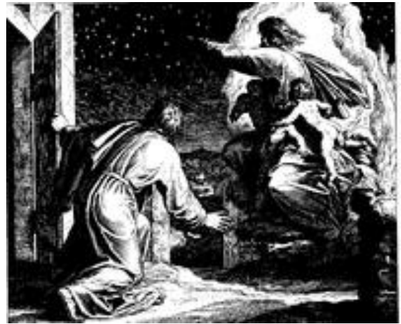
The Vision of the Lord Directing Abram to Count the Stars (woodcut by Julius Schnorr von Carolsfeld from the 1860 Bible in Pictures )

God then sealed this promise to Abram and his descendants in a blood covenant. God caused Abram to fall into a deep sleep while the Spirit of the Lord, as smoke and fire, passed through the cut pieces of the sacrificial animals.