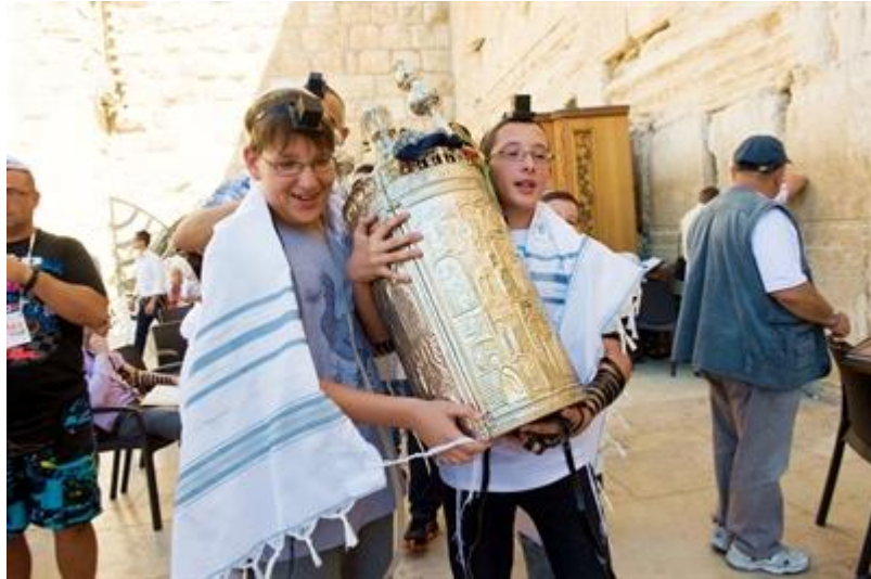
A Bar Mitzvah boy at the kotel (Western Wall) in Jerusalem holding the Torah scroll