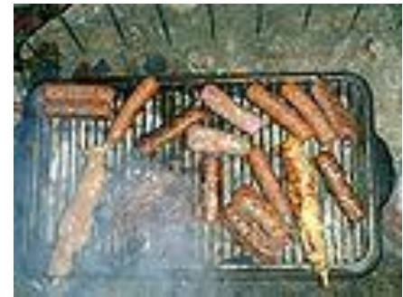
Israeli style mangal

Balconies, parks, schools and buildings all over Israel are decorated with Israeli flags; and most vehicles display a small Israeli flag as well hanging from their windows or attached to their side view mirrors.