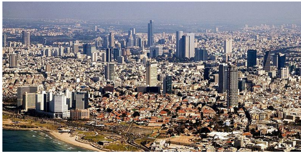
Tel Aviv Today 5

The re-birth of the nation of Israel after centuries of its people being scattered in exile and its land completely dry and barren is undeniable evidence that God's Word is true! Just as three of our foremothers, Sarah, Rebecca, and Rachel were all barren until God supernaturally opened their wombs 6 , so too did God supernaturally bring forth new life in Israel after lying barren for centuries. Even our Messiah Yeshua was conceived in a miraculous way; is it any wonder that the re-birth of Israel is also a miraculous, supernatural event?