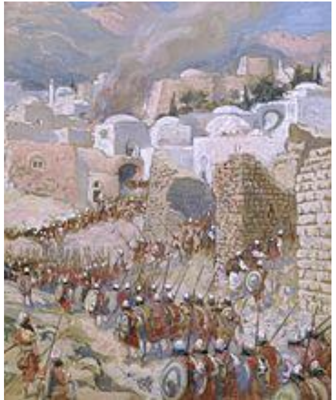
The Battle of Jericho, James Tissot

‘Moses My servant is dead; now therefore arise, go over this Jordan, you, and all this people, unto the land which I do give to them, even to the children of Israel... Be strong and of good courage; for thou shalt cause this people to inherit the land which I swore unto their fathers to give them.’ (Joshua 1:2,6)