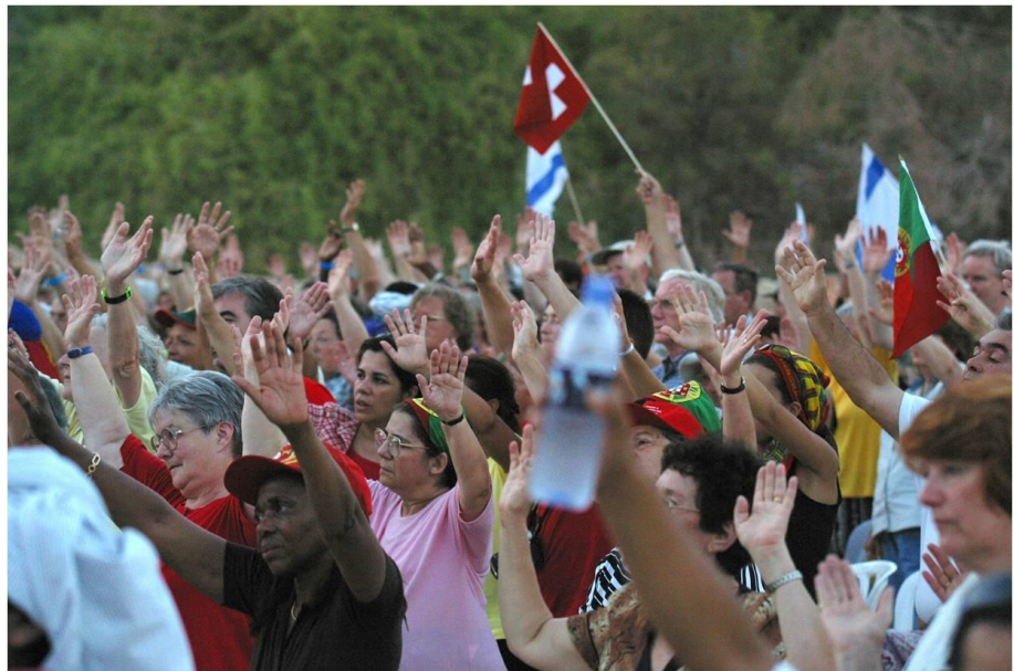
Christian gathering at Feast of Tabernacles in Jerusalem

I fear for the portion of the Gentile Church that is being deceived into allying themselves with the enemy, just as they sided with Hitler during World War II. The red dragon, Hasatan, will lead the whole world astray with regards to Israel, but the people who know their God should not be following them into the pit.