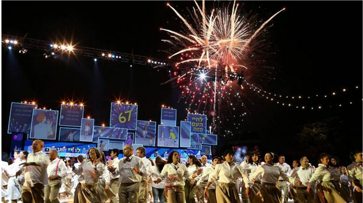
Torch lighting ceremony on Mount Herzl

As the sorrow of Israel's Remembrance Day ceremonies wind down at dusk, the rejoicing of Independence Day festivities are just beginning with an official ceremony and torch lighting on Har (Mount) Herzl. Twelve torches are lit to represent the twelve tribes of Israel.