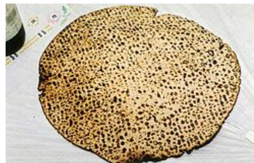
Hand made shmura matzah

Therefore let us keep the Festival, not with the old bread leavened with malice and wickedness, but with the unleavened bread of sincerity and truth.” (1 Corinthians 5:7-8)