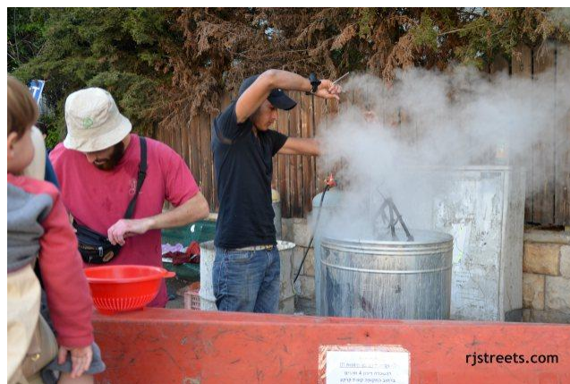
Boiling pots to make them 'Kosher for Passover'

Israeli supermarkets begin to sell everything 'kosher for Passover' - even the shelving paper is marked kosher for the feast. Once, teasing the cashier a bit in good fun, we asked if she could make sure that the diapers we were buying were kosher for Pesach (Hebrew word for Passover). In all seriousness, she actually got on the phone and called customer service to ask. ☺