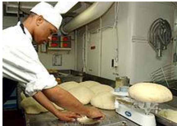
A baker prepares yeasted dinner rolls.

“Your boasting is not good. Don't you know that a little yeast works through the whole batch of dough?” (1 Corinthians 5:6)