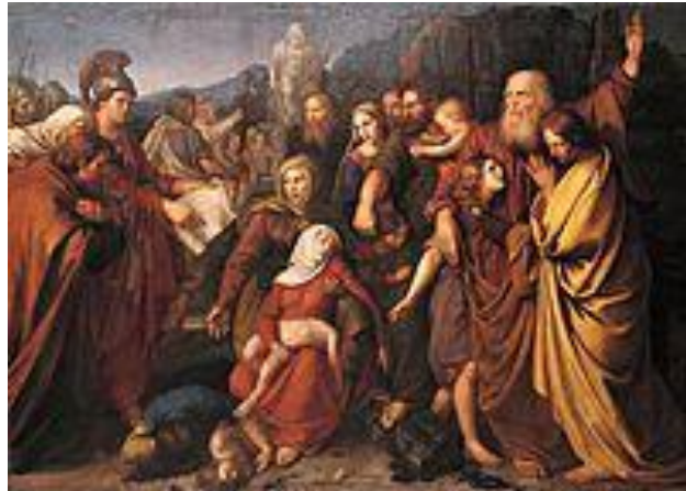
Wojciech Stattler's "Machabeusze" ("The Maccabees") , 1844

How do the Maccabees speak into our lives today? I believe they stand as an example for us in these end times. These few brave men stood against the crowd to defy all the ungodliness of their day in defense of the One True God and their faith. In doing so, they rebelled against not only the Syrian-Greek-Hellenistic oppressors; but also against the ungodly, compromising, humanistic government and population of their own people, Israel.