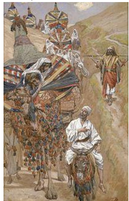
Rebecca Meets Isaac by the Way (watercolor circa 1896–1902 by James Tissot )

May we each embody the diligence, servant’s heart, beauty, purity, willingness, kindness, courage and faith of our mother, Rivkah, in order to be that Bride of Messiah the Servant of the Father is seeking.