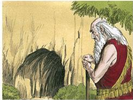
Abraham bought a piece of land with a cave on it.

Abraham and Sarah exemplified love and devotion to God, one another and love for their neighbor. Whatever we do during the span of our lifetime, may everything bring honor and glory to God and His Kingdom.