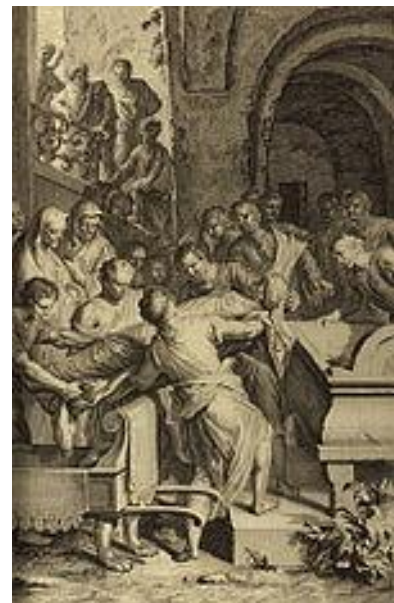
Isaac and Ishmael Bury Abraham (illustration from the 1728 Figures de la Bible )

In the end, it was the death of their father, Abraham, that brought reconciliation between the two feuding brothers: Isaac and Ishmael. It was the sad task of burying their father that brought the estranged men together and caused them to lay aside their long-held grudges. Let us hope that, should there be a long-standing family feud between brothers or sisters that it would not take the death of a parent to bring peace, harmony and reconciliation.