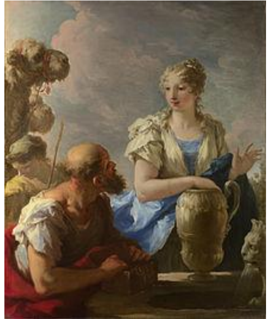
Rebecca at the Well by Giovanni Antonio Pellegrini

We don't always see the whole plan or the big picture and this can be scary. The bride does not shrink back in fear, but is bold and courageous , possessing a faith that the journey into the unknown will be safe because the ‘servant’ of the Father is with her. We do not travel alone. God promises to be with us wherever we go; He upholds us with His righteous right hand and will never leave or forsake us. 17