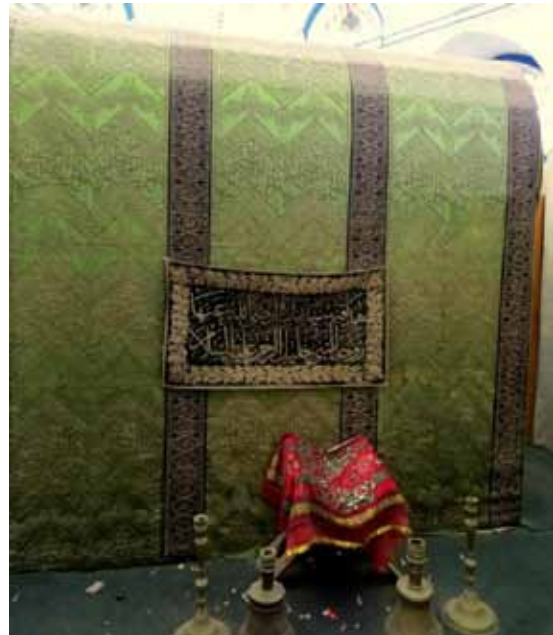
Mausoleum of Sarah, Abraham's wife in the Mosque of Abraham

Rav J.B. Soloveitchik wrote, “Without Sarah, Avraham takes leave of the world stage.” It has been often said that behind every good man is a great woman. Sarah showed herself to be the great woman who helped ensure the successful continuation of Abraham’s dynasty.