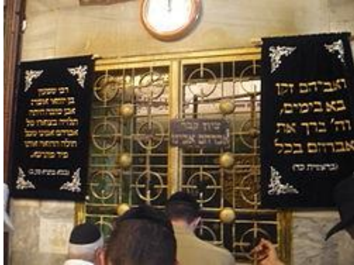
Tomb of Abraham

In the words of King Solomon, " And the earth returns to the land as it was, and the spirit returns to God, who gave it. " (Ecclesiastes 12:7).