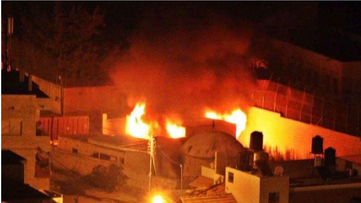
Joseph's Tomb in Nablus ablaze in the early hours of 16.10.15

The tomb where both Sarah and Abraham were buried in the cave of the field of Machpelah (which is in Hebron), is an area now pre-dominantly Muslim. Their tombs have been covered by a large mosque and access given to Jews is limited. On October 15 th , 2015, Palestinians set fire to the tomb of Joseph in Nablus. Hundreds of Arab youth threw Molotov cocktails at the compound, thereby desecrating this holy site. 5