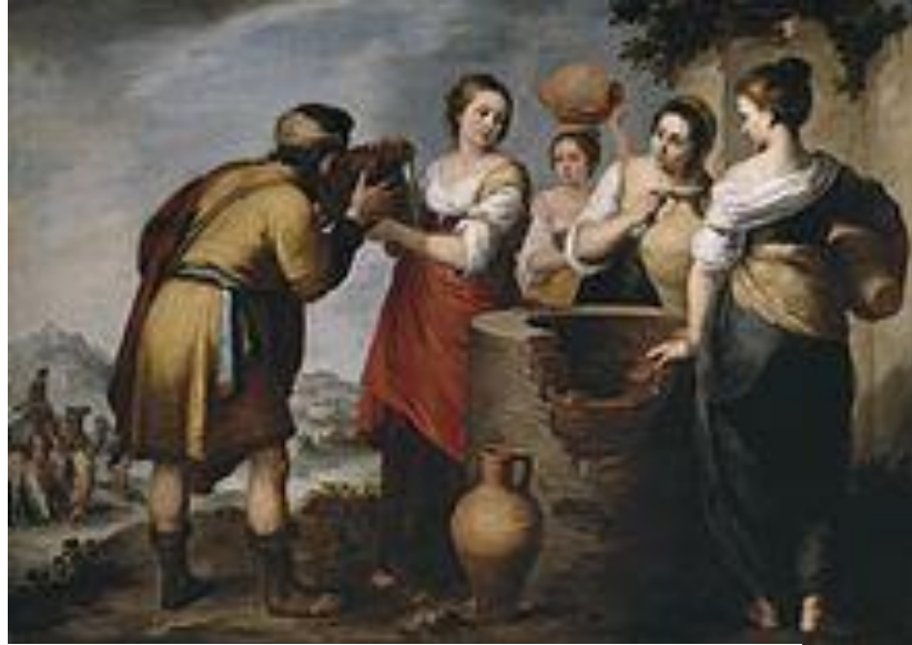
Rebecca and Eliezer by Bartolomé Esteban Murillo, 17th century.