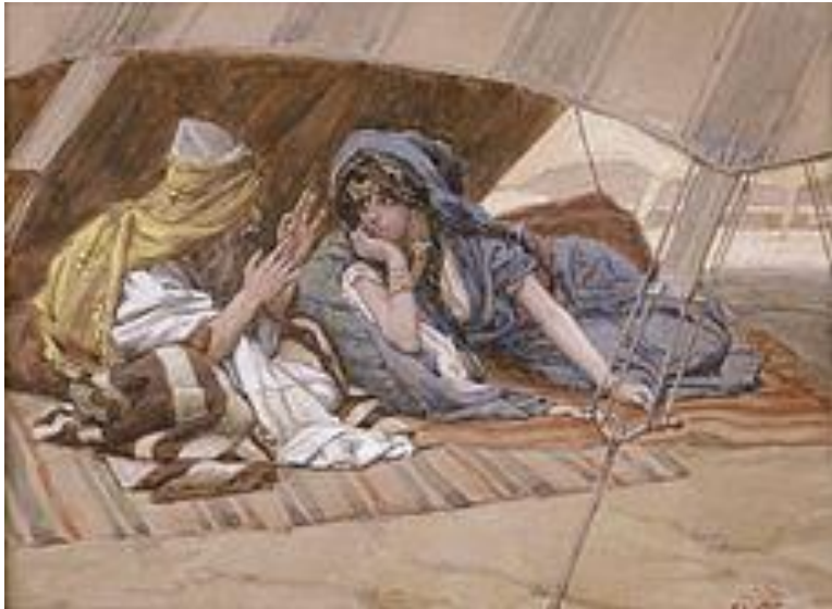
Abram's Counsel to Sarai (watercolor circa 1896–1902 by James Tissot )

In this week's parashah, we will take a look at the life of Sarah, and see what lessons we can learn from this great Matriarch of our faith. “And the life of Sarah תַּיִי שָׂרָה was a hundred and seven and twenty years; these were the years of the life of Sarah.” (Genesis 23:1)