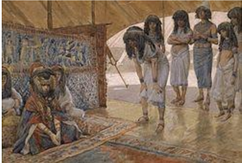
Sarai Is Taken to Pharaoh's Palace by James Tissot .

She did not allow fear of the consequences of the wrong decisions of her husband to cause her to sin through disobedience. Wow! How many of us women could say the same? Selah (pause and think about this).