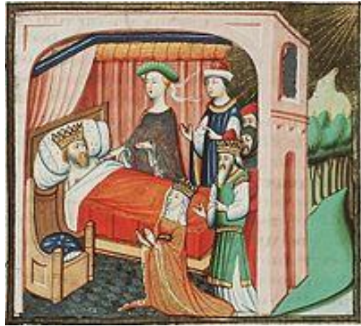
Abishag at the bed of David, with Bathsheba, Solomon, and Nathan (from a Dutch Bible circa 1435)

On the other hand, David's son, Adoniyah, showed himself to be willful, proud, disobedient, disrespectful of his father, and rebellious towards his authority. He doesn't even wait for his father's death before he exalts himself, saying, "I will be king!" 18