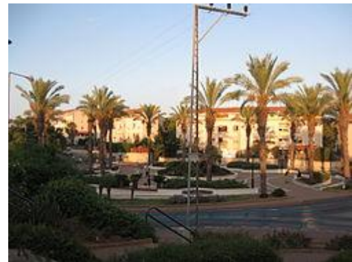
City of Ariel

The leader of this group also presented the leader of the city of Ariel with a cheque for $30,000 U.S. to be used toward programs assisting new immigrants integrate into Israeli society. Faith Bible Chapel also supported a kindergarten center for handicapped and disabled Israeli children in Ariel. What a powerful example of people who have taken seriously the exhortation to bless Israel!