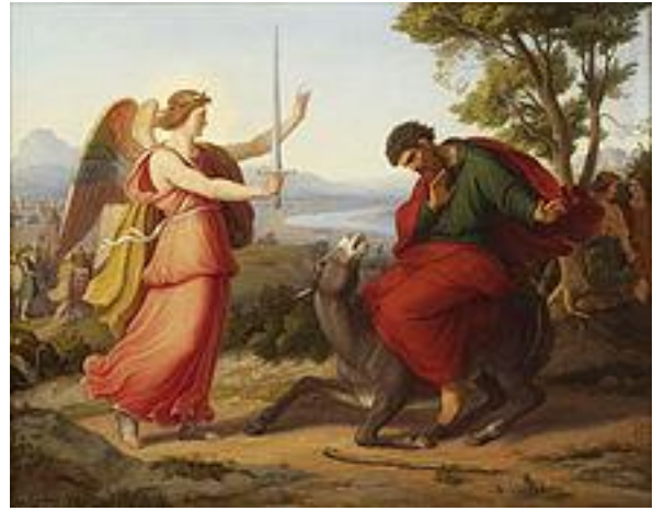
Balaam and the Angel (1836 painting by Gustav Jaeger)

Jewish mystics believe that animals can see into the spiritual realm to see supernatural beings such as angels or demons that humans generally cannot see. The supernatural realm is very real; but usually kept well hidden from the human experience unless deemed necessary.