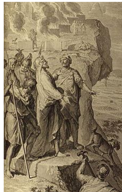
Balaam Blessing the Israelites (illustration from the 1728 Figures de la Bible )

Although Balaam possessed legendary supernatural powers, God proved Himself to be greater than these. Three times Balaam tried to curse Israel; and three times he involuntarily blessed them instead. Many peoples and nations have tried to destroy Israel over the centuries but none have succeeded to wipe Israel off the map as they have desired. Hamas and other Muslim terrorist groups have written into their charter their stated purpose – to annihilate the state of Israel and drive her people into the sea.