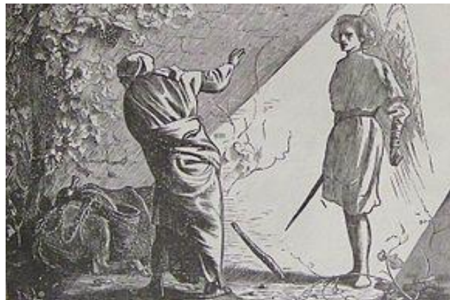
Balaam and the Angel (illustration from the 1890 Holman Bible)

Finally, the Lord opened Balaam’s eyes, and he too saw the angel of the Lord. Balaam realized his error and prostrated himself in repentance. The angel of the Lord asked Balaam, ‘Why have you beaten your donkey, since I am come as a ‘satan’ יָצַו unto you, since “thy way is contrary unto Me.” (Numbers 22:32)