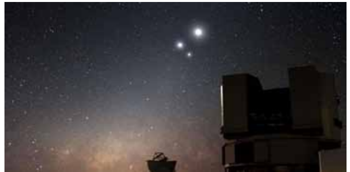
Venus and Jupiter as seen in the sky June 30 th 2015

The fulfillment of this prophecy is found in Matthew 2:2: “Where is the one who has been born king of the Jews? We saw his star in the east and have come to worship Him.” Yeshua is our ‘bright and morning star’.