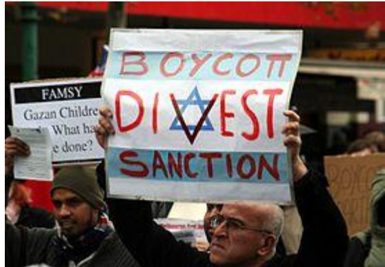
Protest against Israel's Gaza Blockade and raid on Mavi Marmara – Melbourne 5 June 2010.

There are some within the Christian Church who not only associate with, but also financially support charities and causes with an anti-Israel and even anti-Semitic agenda. From the example of Balak and Balaam, we can see that being drawn into despising Israel is a dangerous path – and it seems that talking donkeys are in short supply these days!