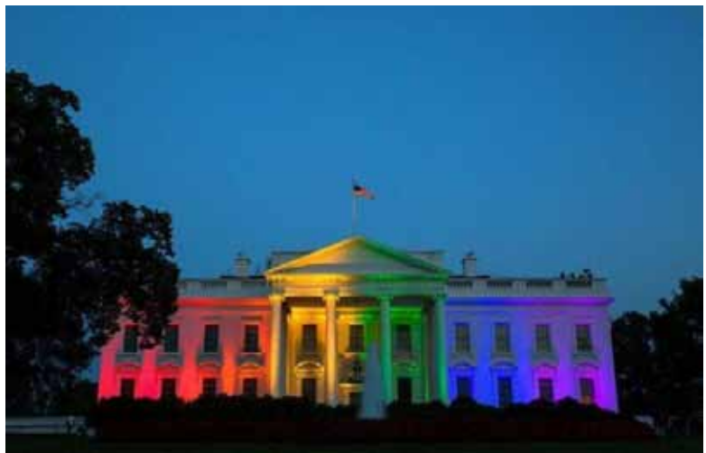
Obama Flaunts 'Rainbow White House' after Same-Sex Marriage Ruling http://www.breitbart.com/big-government/2015/06/26/

In a disastrous move, the U.S. Supreme Court just passed a law making homosexual marriages legal in all fifty states. 16