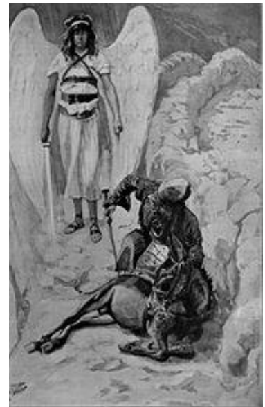
Balaam and the Ass (watercolor circa 1896–1902 by James Tissot )

'Satan' is not really the devil's name. In Hebrew he doesn't even have a name but a title – 'the adversary'. We often blame 'the devil' for frustrating our plans and standing in the way of the path we wish to take, but we must keep in mind that this adversary (satan) may be a messenger sent from God to keep us from following our chosen pathway leading to destruction.