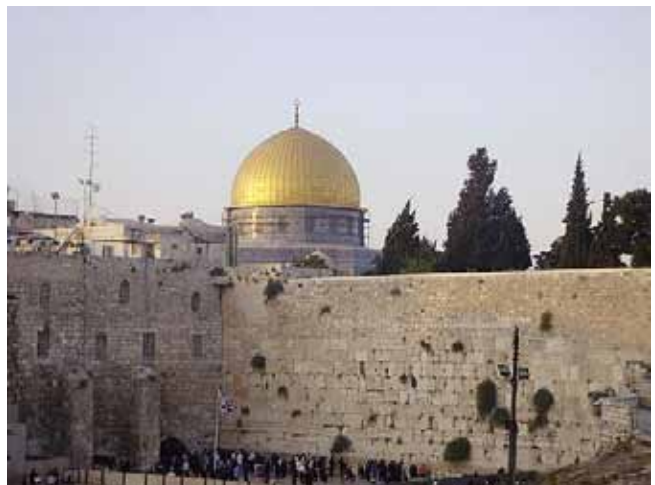
Jerusalem Western Wall Plaza

“For the nation or kingdom that will not serve you will perish; it will be utterly ruined.” (Isaiah 60:12)