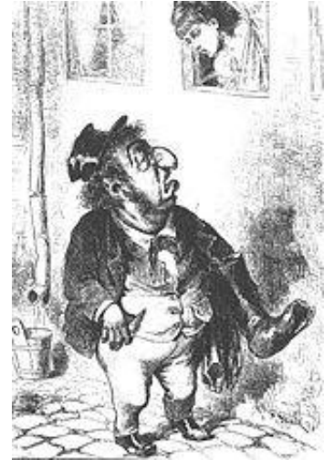
An 1873 caricature depicting the stereotypical physical features of a Jewish man

I could feel my body beginning to tremble in what I perceived as righteous anger of the Lord. Such stereotyping of Jewish people or any other racial or ethnic group is disgraceful in the house of God. I confronted him for teaching the children such false things about the Jewish people and reminded him that Yeshua, our Lord and Saviour is also a Jew; therefore by mocking the Jews' appearance, he also dishonored the Lord.