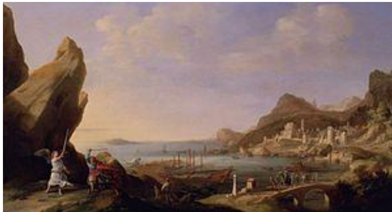
Coastal Landscape with Balaam and the Ass (1636 painting by Bartholomeus Breenbergh )

“And Balak, the son of Zippor, saw all that Israel had done to the Amorites.” (Numbers 22:2)