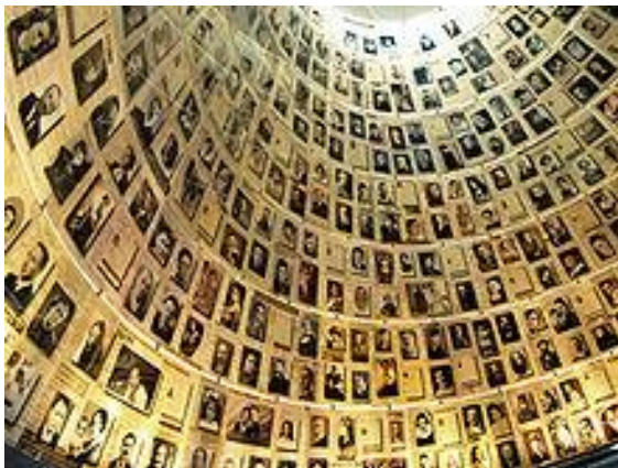
The Hall of Names containing Pages of Testimony commemorating the millions of Jews who were murdered during the Holocaust