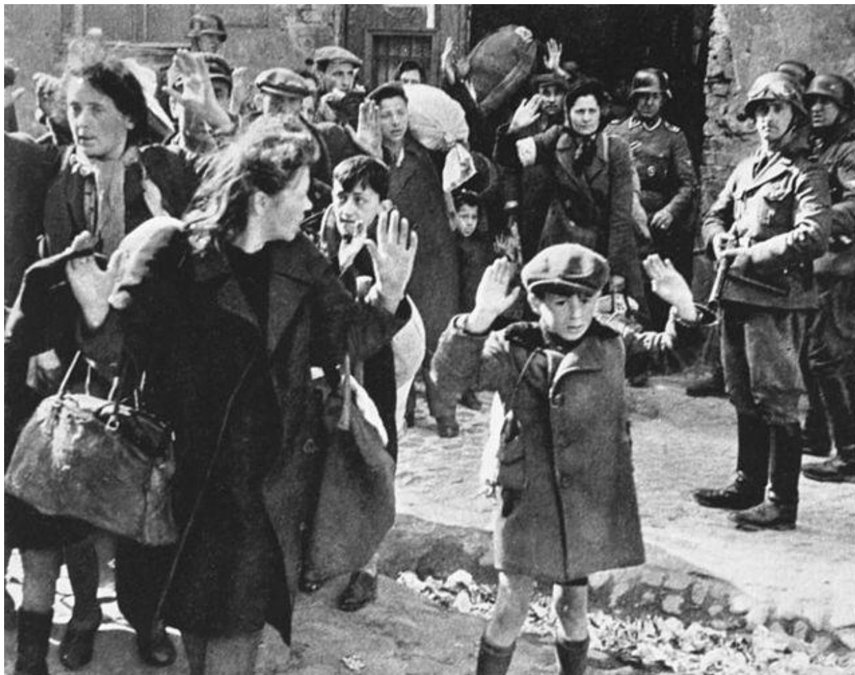
1943 April - Mai

Yom HaShoah, also called ' Yom Zikaron laShoah v'laG'vurah ' { יום הזיכרון לשואה ולגבורה } (Holocaust and Heroism Remembrance Day), commences at sundown in Israel and in all the nations of the world. In Jerusalem the Memorial Day begins with a ceremony at Yad Vashem ( יד ושם ) the Holocaust Memorial Museum in Jerusalem. The name, "Yad Vashem" is taken from a verse in the book of Isaiah, " Even unto them will I give in my house and within my walls a place and a name (yad vashem) better than of sons and of daughters: I will give them an everlasting name, that shall not be cut off " (Isaiah 56:5).