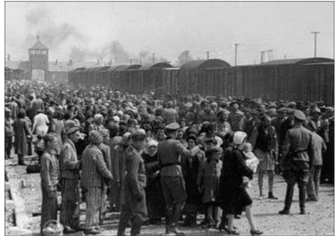
Hungarian Jews are selected by Nazis to be sent to the gas chamber at Auschwitz concentration camp , May 1944