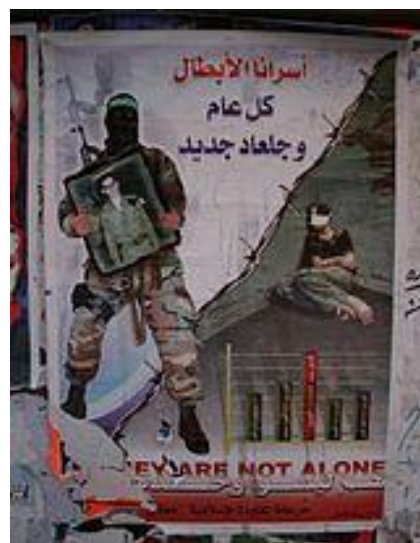
Hamas poster with Israeli hostage

The Christian church is tragically deceived if they think that Islam will stop at annihilating the Jews and Israel. Just because the queen is in the King’s house, she is not safe from the forces of destruction and terrorism that threaten the Jews.