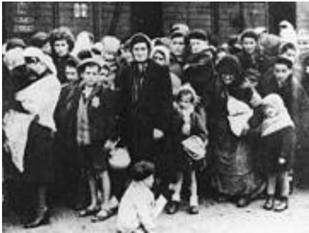
Jews on selection ramp at Auschwitz

It is a silence which, without even a word, speaks of the unspeakable.