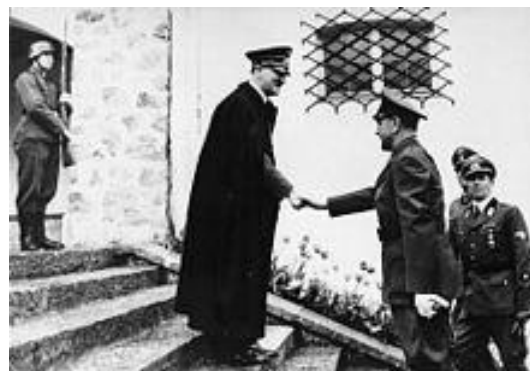
Germany's Führer Adolf Hitler (left) with Ustaše Poglavnik Ante Pavelić (right) at the Berghof outside of Berchtesgaden , Germany

“For you are a people holy to the Lord your God. The Lord your God has chosen you out of all the peoples on the face of the earth to be His people, His treasured possession [segulah].” (Deuteronomy 7:6)