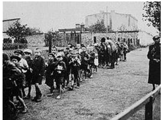
Jewish children during deportation to the Chelmo extermination camp

It seems to me that many people ask, “Why can't we just 'forgive and forget' ? Why do we have to look at all these terrible old photos? Why construct a whole museum with the purpose of preserving evidence of this darkness and evil? Why must we have a memorial day just to dredge up all these painful memories of sadness and loss”?